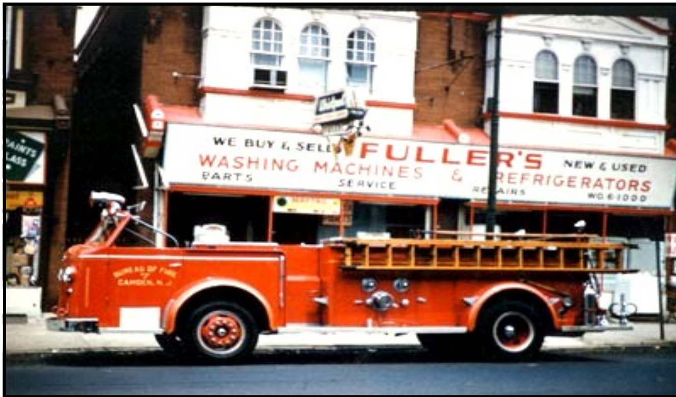
American La France Pumper Camden, NJ Bureau of Fire Number 7 Engine Company (which served the "Old Neighborhood" ) Pictured in front of Fuller's Washing Machines and Refrigerators at Mt Ephraim and Kaighn Ave. The firehouse is to the right of Fuller's (circa 1960)